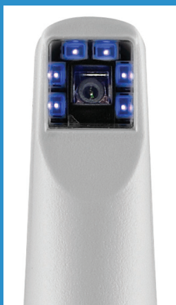
Up close view of new wand technology